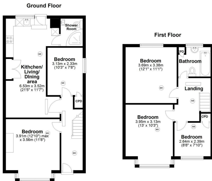
144 Lodge Hill Rd, Selly Oak, Birmingham